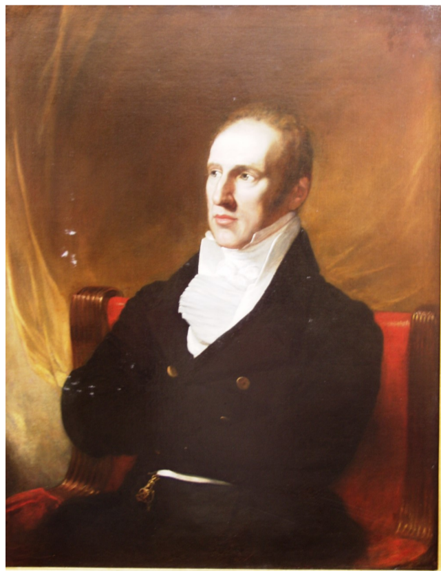
John Walter II, editor of The Times

The Library and Archives Committee is pleased to present: